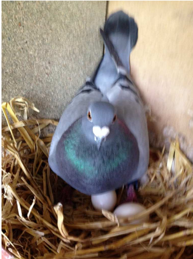
Smith & McCallum Cumbernauld 3 rd section F