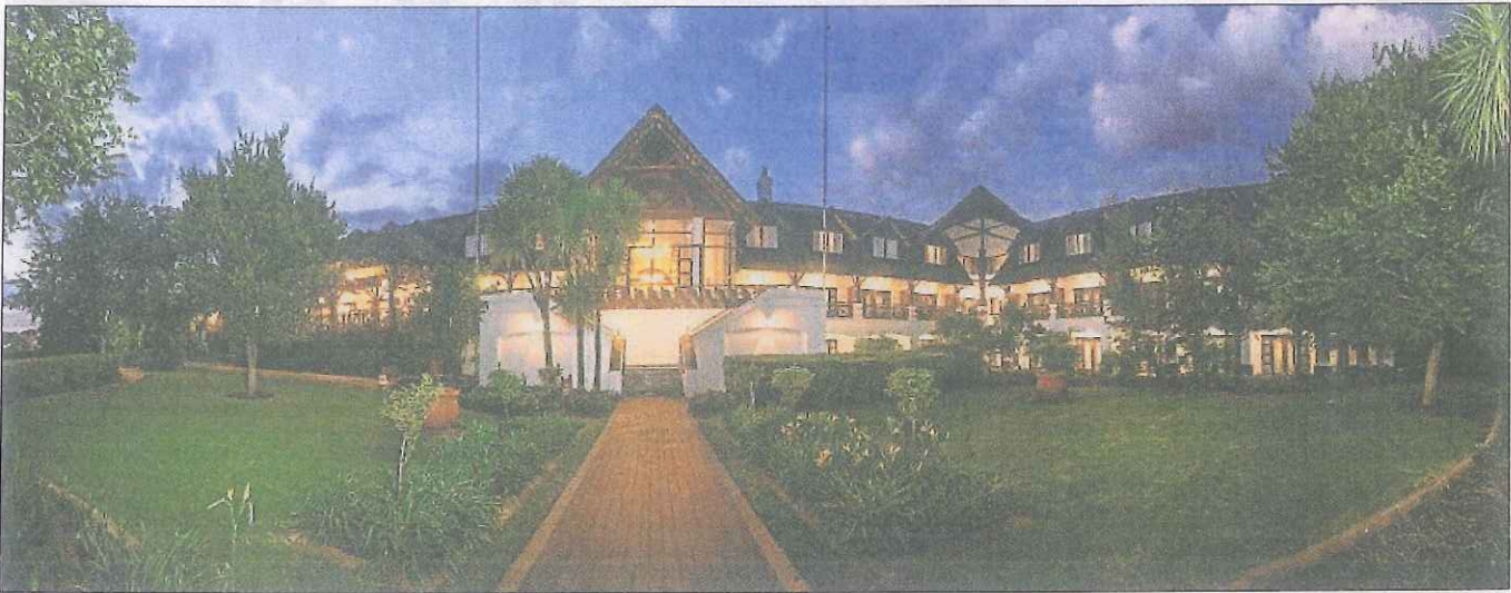
The entrance to the stunning 4-star Emerald Hotel.

or syndicate can win this great race, perhaps if you decide to enter some pigeons into this race, it could be your turn to win the 21st SAMDPR? This event has always paid out all the advertised/projected and promised prize money from day one and has the tag of 'The Greatest & Biggest One Loft Race In The World' and 'The Race With The Proven Track Record'. It has also been classed around the world as 'The Olympic Games' in the pigeon racing world. Over the past 20 years this race has gone from strength to strength and has