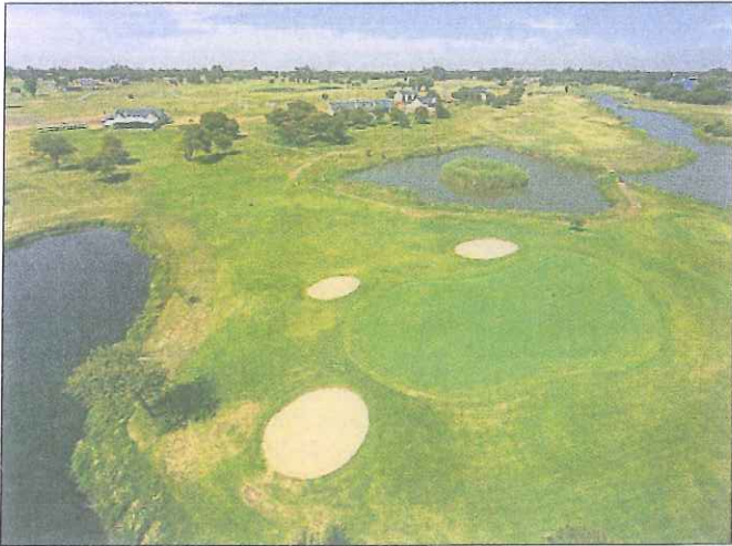
Stunning views over the Heron Banks golf and river estate.