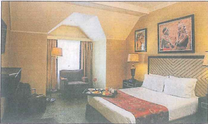
A hotel room in the Emerald Hotel.