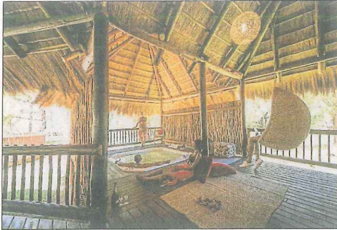
The VIP lodge at Emerald Casino & Hotel.