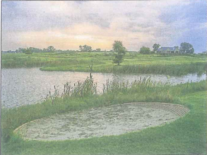
Another stunning view over the Heron Banks golf and river estate.