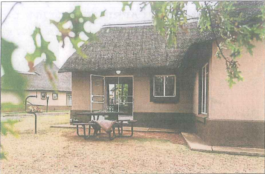
River Resort chalet at Emerald Casino & Hotel.