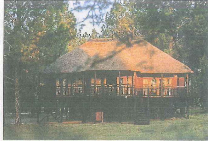
A superb bush lodge at Emerald Casino & Hotel.