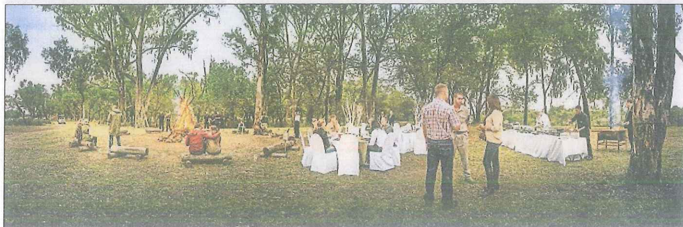
A typical bush braai in South Africa.