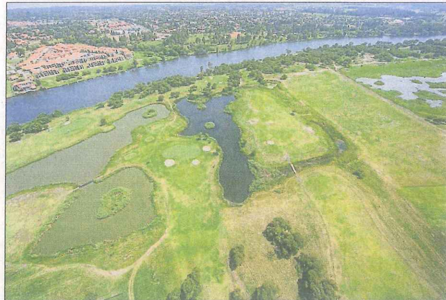
Parts of the Heron Banks golf course with the Vaal River and the Emerald Casino & Hotel in the background.

Heron Banks Golf & River Estate ( www.heronbanks.co.za ) is situated just 95km (60 miles) by road from O.R. Tambo